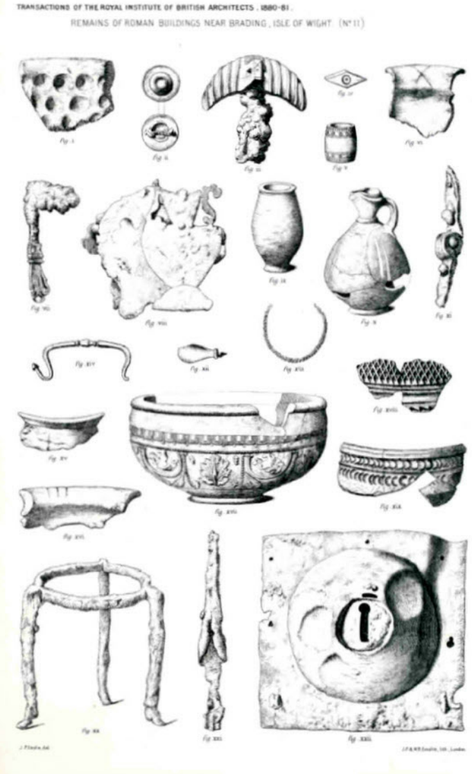
Objects discovered during the Victorian excavations